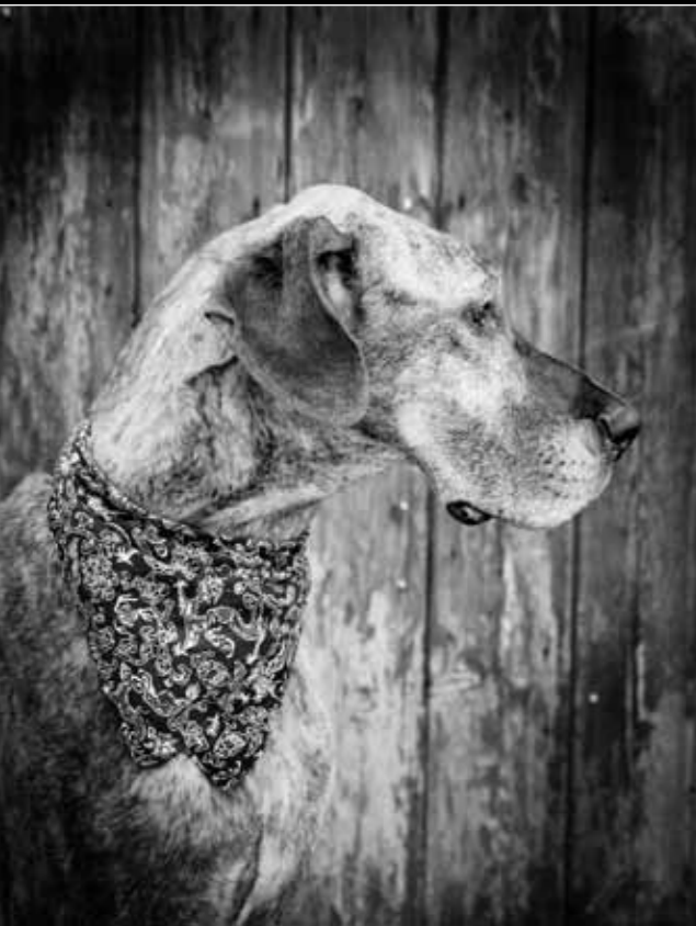
Tamara Peol (Affiliate)