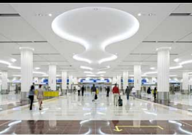
Gerry O'Leary FBIPP