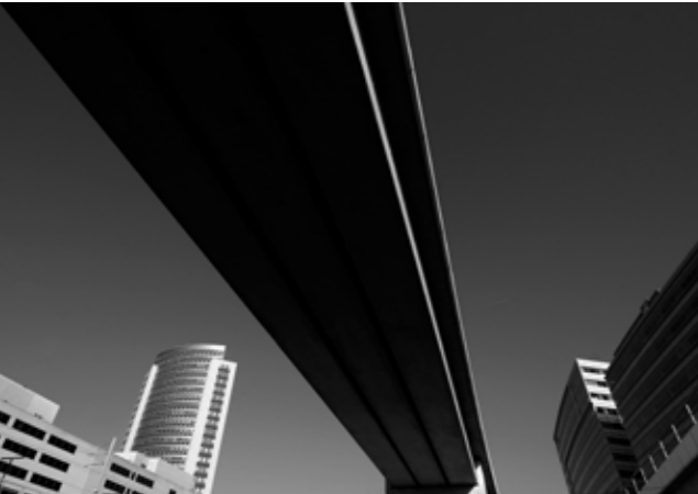
René Kempes ABIPP