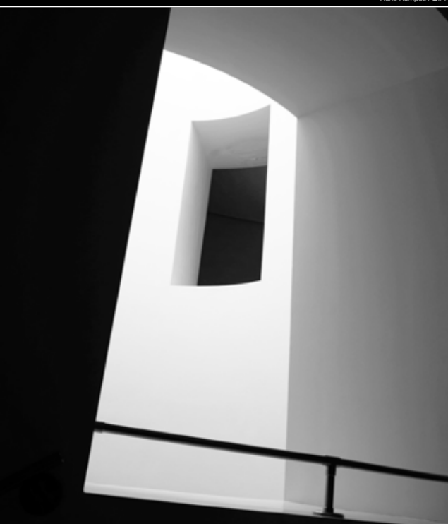
René Kompes ABIPP

Welcome to an organisation at the forefront of professional photography, qualifying, training & supporting the very best photographers in the world.